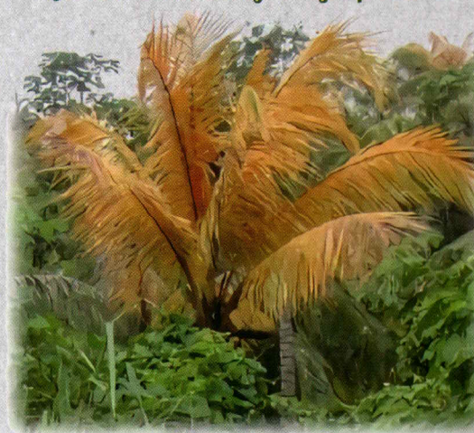
Lethal Yellowing Disease