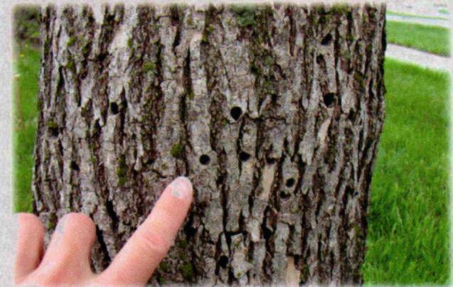
Tree Borer Damage