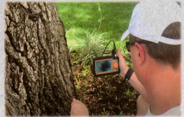
Inspecting a Live Oak with Borescope